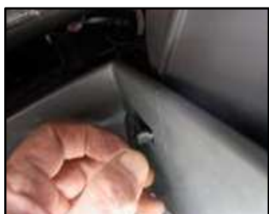
Step-4 Pull out Black Plastic Stay from right rear of glove compartment.