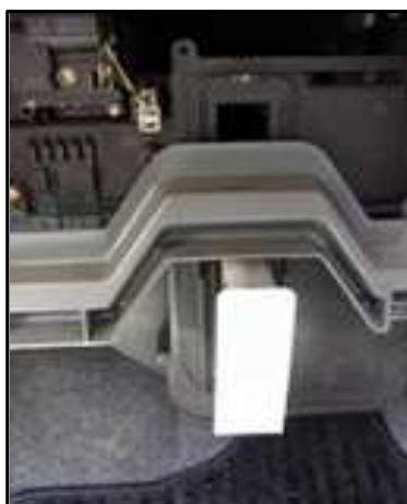
Step-13 Slide in "Good Old" or "New" "Upper" Air Filter Element into Cavity.