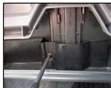
Step-7 Remove left phillips screw from passenger's side shelf.