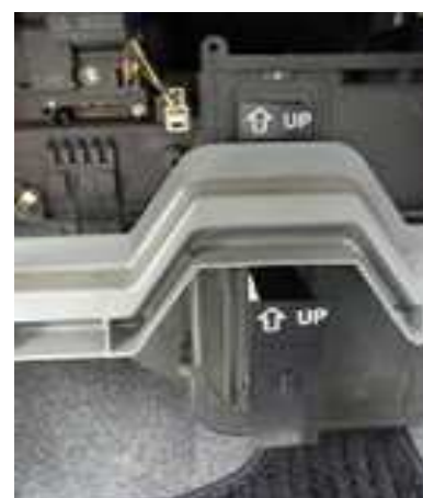
Step-11 Slide out and remove "Lower" Air Filter Element from Cavity. Inspect Element.