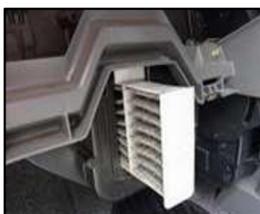
Step-14 Slide in "Good Old" or "New" "Lower" Air Filter Element into Cavity.

Caution: Ensure that the "Rounded" Corners of front plate, faces "Down"