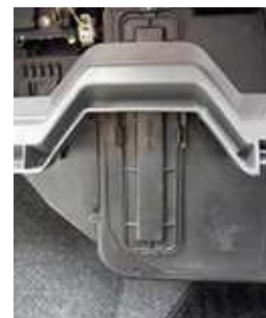
Step-17 Line up the lower tab of the Air Filter Cavity Cover and push down to engage lower tab into the slot in the lower cavity surface.