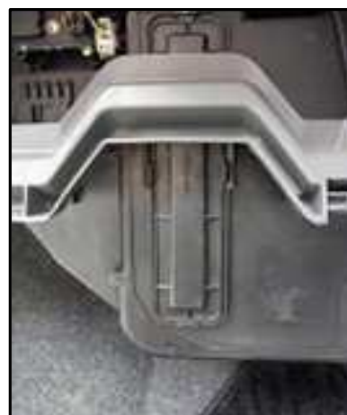
Step-9 Push up to release lower tab on Air Filter Cavity Cover.