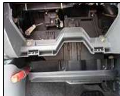
Step-5 Remove glove compartment.