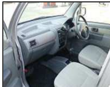
Step-1 Open Passenger Side Door