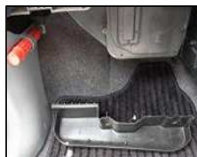
Step-8 Remove passenger's side shelf.