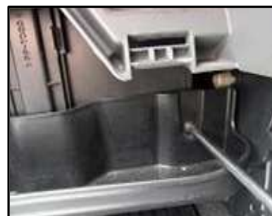
Step-6 Remove right phillips screw from passenger's side shelf.