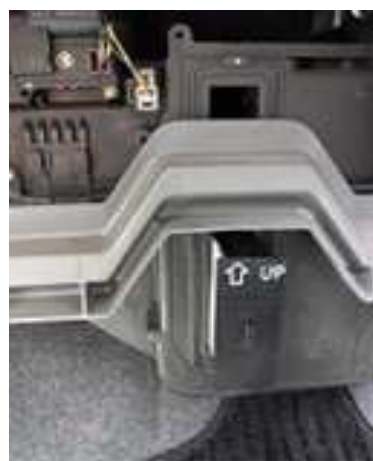
Step-12 Slide out and remove "Upper" Air Filter Element from Cavity. Inspect Element.