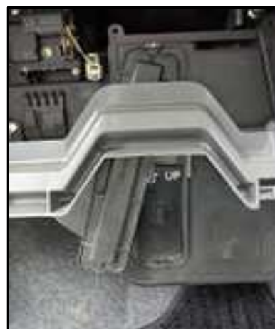
Step-10 Remove Air Filter Cavity Cover.