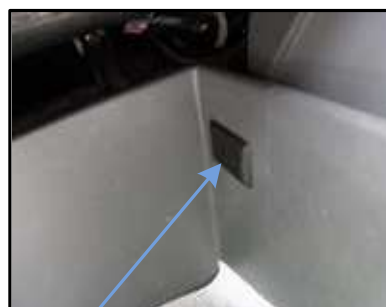
Step-3 Locate Black Plastic Stay