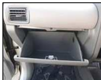
Step-2 Open Glove Compartment