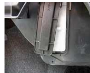
Step-16 Line up the upper tab of the Air Filter Cavity Cover and push up slightly.